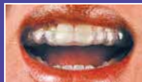
Nightguards are custom-made and easy to insert or remove.