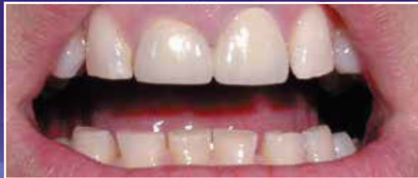
Bruxing can wear down and destroy your teeth.

D o you wake up with a stiff, tired jaw? Are your teeth sensitive to cold drinks? If you answered yes to either of these questions, you may be grinding or clenching your teeth during sleep. Grinding of the teeth is a medical condition called bruxism. Over time, bruxism will result in the wearing down of your natural tooth enamel.